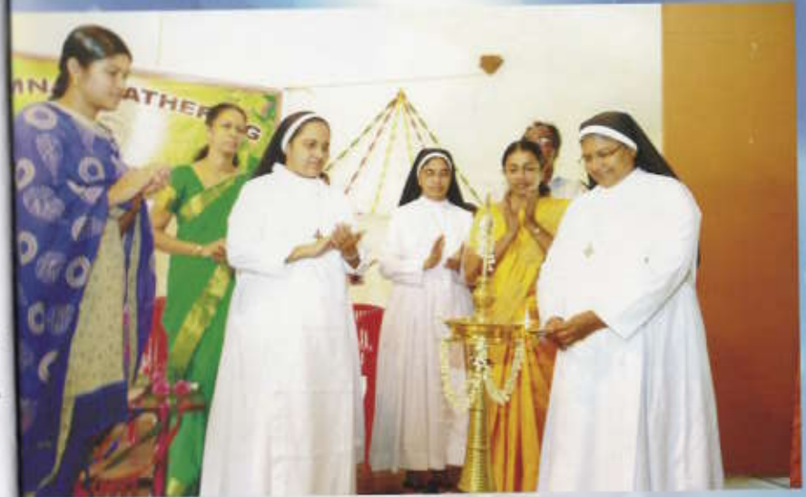
Inauguration of Alumnae Gathering