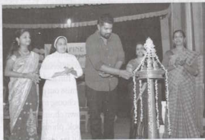
Fine Arts Inauguration by Shri. Joju Mala, Cine Artist